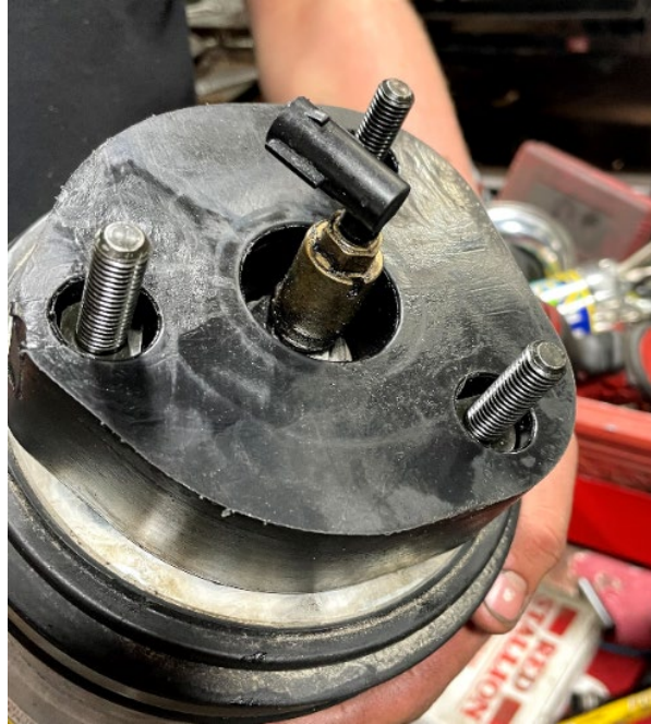
Spacer Image #1