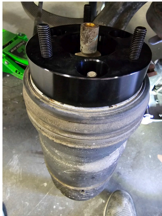
Spacer Image #2