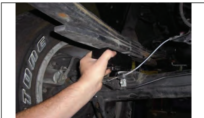
Place new lift block into position between axle and leaf pack.