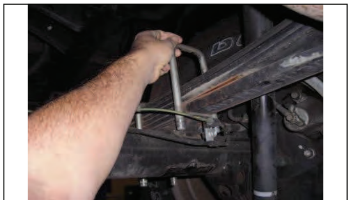
Carefully lower axle and remove u-bolts