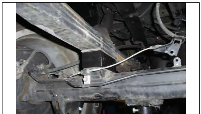
Raise axle and ensure locating pins are properly aligned.