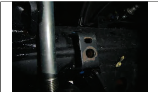
Axle tabs and brackets are different on either side.