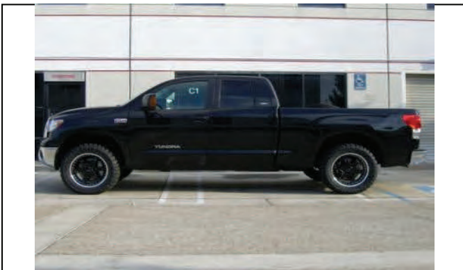
**TUNDRA ONLY using 66-5002, follow these steps.**