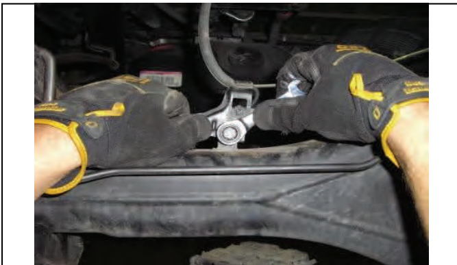
Replace shock on mount and ABS line to axle.