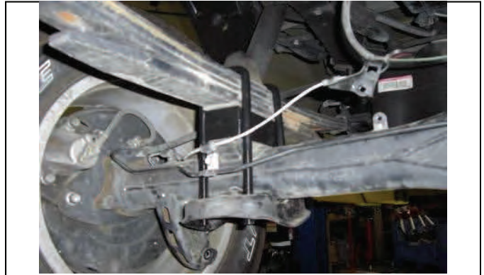
Attach lower mounting plate with provided hardware.