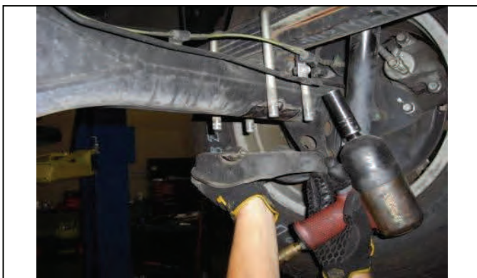
Remove u-bolt nuts and lower plate.