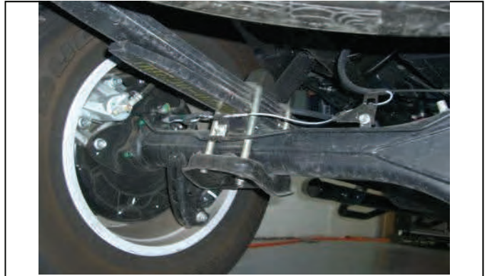
Work on one side at a time to prevent driveline damage.