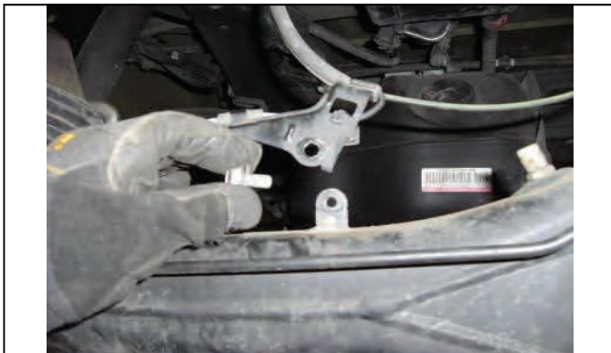
Disconnect ABS wiring brackets from axle.