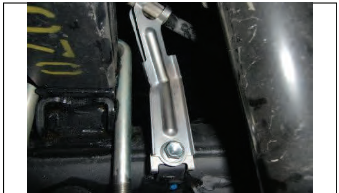
Remove brake line bracket bolt from axle tab.