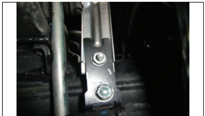
Install provided brackets with OE and provided hardware.