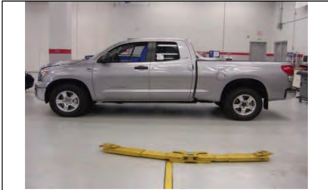
Raise vehicle securely by frame and support axle with jack..