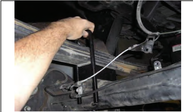
Slide new u-bolts over leaf pack and bump stop bracket.