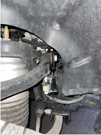
Front Revel Link